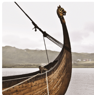
Traders and Raiders