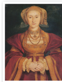
Anne of Cleves by Hans Holbein

Holbein was a German artist and portrait painter. He travelled to England in 1532 with the backing of Anne Boleyn and Thomas Cromwell. In 1535, he became the King's Painter. Holbein painted many portraits of the royal family and the nobles. He was also asked to paint a picture of Anne of Cleves so Henry could decide if he wanted to marry her. Henry liked the portrait but the marriage only lasted six months because Anne didn't look as beautiful in real life as she did in her portrait.