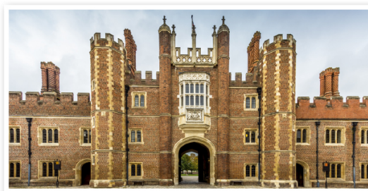
Hampton Court Palace

Henry VIII had over 60 homes and his favourite was Hampton Court Palace. Henry enjoyed showing off his wealth at court. It became a centre for his favourite things, including art, music, dance, poetry and tournaments. The richest and most important people in the country also lived at court. To show their wealth and impress the king, the courtiers wore expensive clothes made of silk, velvet and lace. They had to please the king, give him expensive gifts and flatter him. If they displeased him, they would be severely punished or even executed.