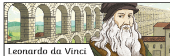
Leonardo da Vinci