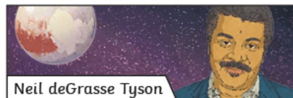
Neil deGrasse Tyson