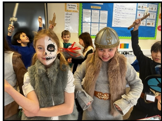
Y4 Vikings during a Topic Week raid!

Topic lessons teach me ... "about interesting things and every time I learn something new."